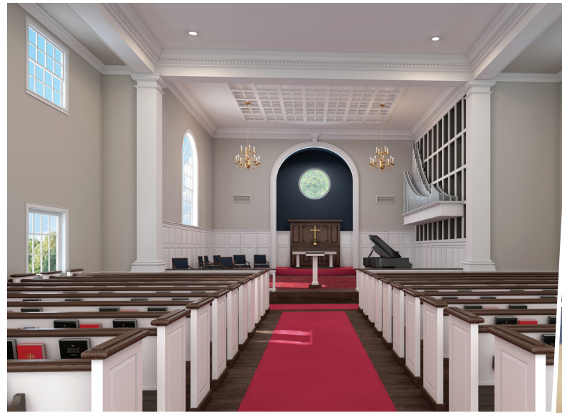
Architectural rendering of the improved Sanctuary.

The Plan: create a level floor, move the communion rail so that everyone can access it without any steps or awkward bottlenecks, regrade the balcony to improve visibility, replace the windows, carpet, sound system, and lights; simplify the arrangement of the chancel so that it's more flexible and everyone can see; update the organ and re-purpose some of the space to increase storage.